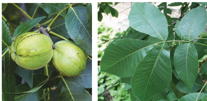
*Paul Wray, Iowa State University

Leaves are compound with 5 to 7 leaflets, but the plant has an alternate branching habit. Fruit are hard-shelled nuts in a green husk.