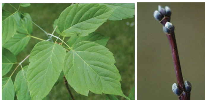
*Paul Wray, Iowa State University

Exhibits opposite branching and compound leaves. However, has 3 to 5 leaflets (instead of 5 to 11) and the samaras are always in pairs instead of single like the ash.