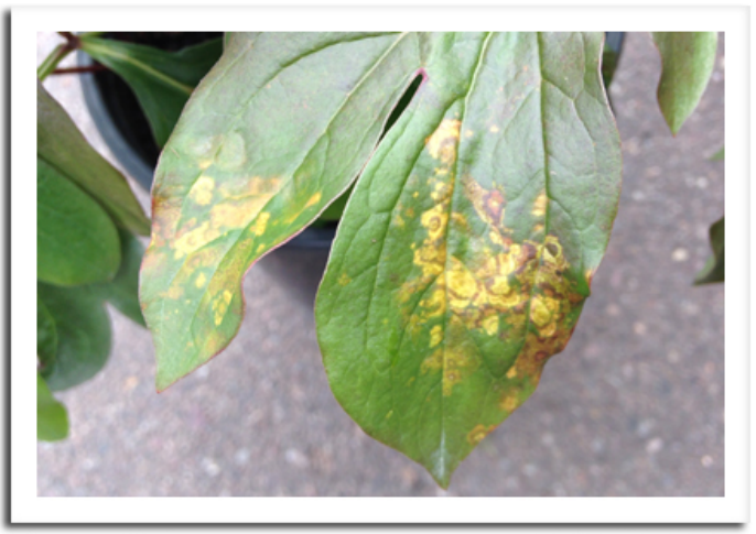
Tobacco rattle virus on peony

TOBACCO RATTLE VIRUS: Nursery inspectors ordered the destruction of several bleeding heart plants and garden peonies last week due to tobacco rattle virus (TRV) infection. Standard symptoms on these hosts are wavy light yellow lines on leaves (bleeding heart) and ringspots (peony). This increasingly prevalent virus infects over 400 plant species, including ornamentals and agricultural crops such as potatoes. TRV can spread via root nematodes, infected cutting tools, or possibly from seeds from infected plants. There is no treatment for TRV and infected plants must be destroyed.