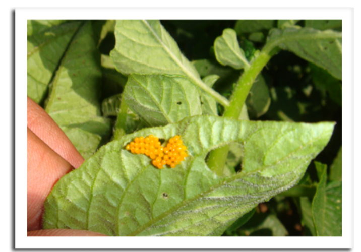
Colorado potato beetle eggs

COLORADO POTATO BEETLE: Overwintered adults have been noted in the Holmen area of La Crosse County, indicating that the beetles are dispersing from hibernation sites and oviposition on potatoes, tomatoes, eggplants and other host plants should begin before the end of the month. The bright orange-yellow eggs are deposited in clusters of 15-30 on the undersides of leaves. Egg hatch occurs in 4-9 days.