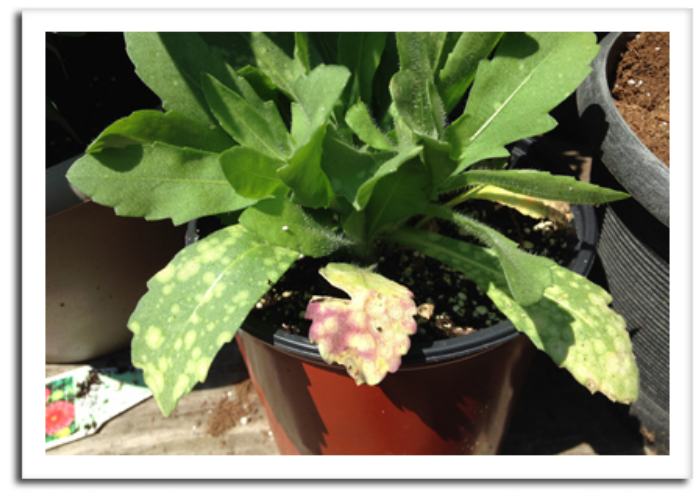
Gaillardia with white smut

WHITE SMUT: This fungal disease was found on Gaillardia (blanket flowers) plants at nurseries in Jefferson and Marathon counties. White smut can be identified by white to yellow-green spots up to ¼ inch in diameter that sometimes contain smaller brownish spots at the center. The fungus is seed-borne and likely overwintered as spores amid<del>st</del> plant material. Proper sanitation and increased plant spacing will help reduce its spread. Removal of affected leaves and severely infected plants is also recommended.