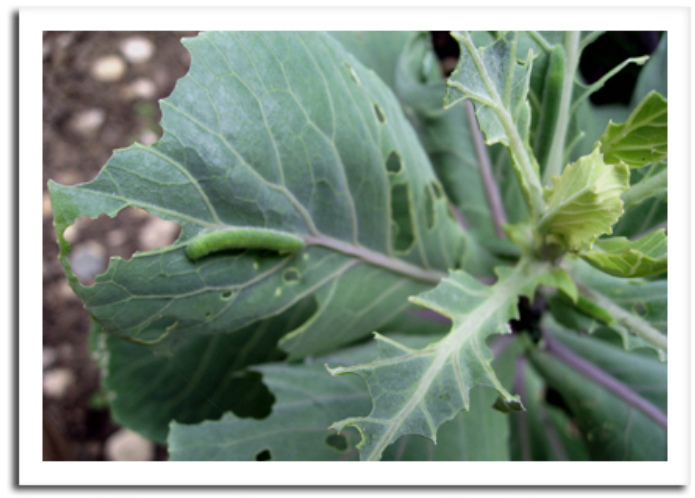
Imported cabbageworm larva

Infestation levels in cabbage that exceed 30% at the transplant to cupping development stages may warrant treatment.