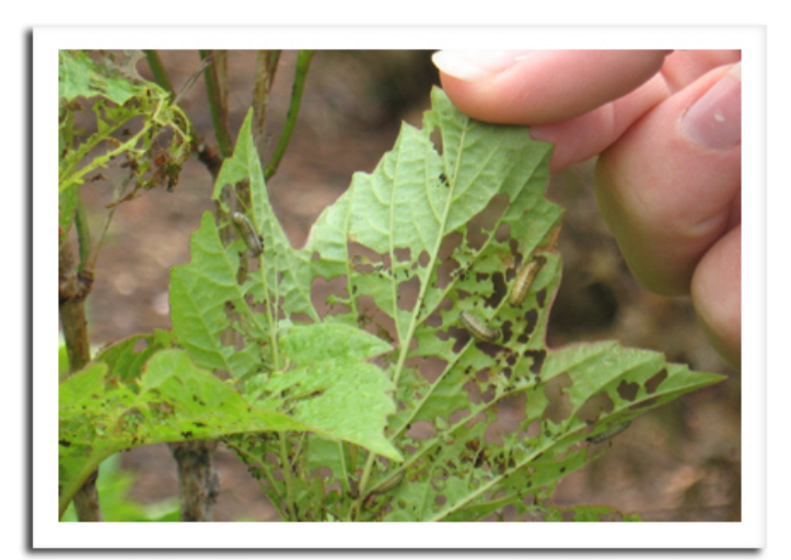
Viburnum leaf beetle larvae

viburnum leaf beetle: Eggs and early-instar larvae of this invasive European beetle are appearing on viburnums in Milwaukee County, one of two southeastern Wisconsin counties (along with Ozaukee County) in which viburnum leaf beetle (VLB) is known to be established. This newly-introduced exotic species is particularly damaging because both the adult and immature forms rapidly defoliate viburnums. Successive feeding by larvae and adults prevents shrubs from re-foliating and can kill otherwise healthy plants after 2-3 years of heavy infestation. Southeastern Wisconsin gardeners, landscapers, nursery stock growers and retailers should be alert to the characteristic, unique skeletonization of viburnum leaves caused by this insect and implement an aggressive treatment program to prevent this pest from spreading.