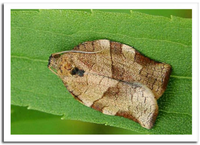
Obliquebanded leafroller moth

emerge over the course of several weeks. The recommended scouting procedure for OBLR is to begin checking terminals for small larvae 7-10 days after the first moths are captured. Although there is no direct correlation between trap counts and larval populations, scouting is important since orchards that register even low counts (< five moths per trap) can develop significant larval problems a few weeks after a flight has occurred. Control is warranted for populations averaging three or more larvae per tree.