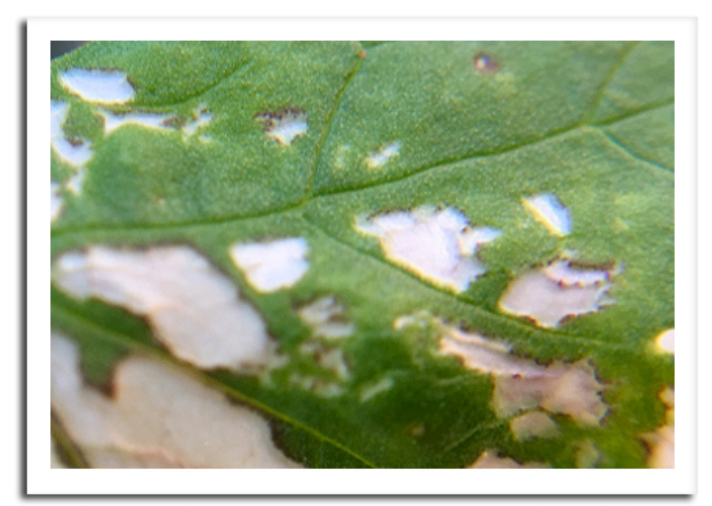
Sawfly feeding damage on cilantro

SAWFLY LARVAE: Evidence of sawfly larval feeding was noted on cilantro, celery, carrot and parsley at plant retailers in La Crosse County. These tiny larvae skeletonize foliage or cause very characteristic windowpane feeding damage before developing into small wasps that resemble flying ants. The adult stage is a beneficial pollinator of flowering plants, but the larvae are capable of causing serious damage to vegetables and herbs. The optimal time to control sawflies is early in the larval stages, using insecticides such as Spinosad and Malathion if warranted. Bacillus thuringiensis (Bt) products are not effective against sawfly larvae.