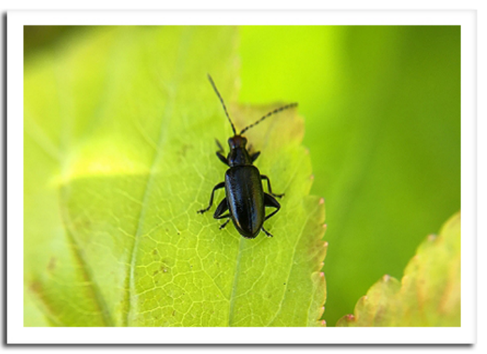
Flea beetle feeding on ninebark

fleshy leaves of sedum and similar plants. Row covers, sticky traps, and insecticides may be used for prevention and treatment. Insecticides directed against the adults are the most effective control, but repeat applications are often required.