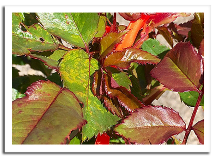
Rose mosaic virus on 'Sunnsprite' rose

ROSE MOSAIC VIRUS: The rose mosaic virus complex was again documented among several rose cultivars during recent inspections at Wisconsin retailers. Yellow leaf mottling, spots and discoloration resembling "lightning bolts" along and between leaf veins are distinctive virus symptoms. Infected plants should be removed and destroyed. Closely inspecting plants before purchase, sterilizing pruning tools between each cutting, and careful breeding of virus-free stock are foremost in preventing spread of this and other common nursery plant viruses.