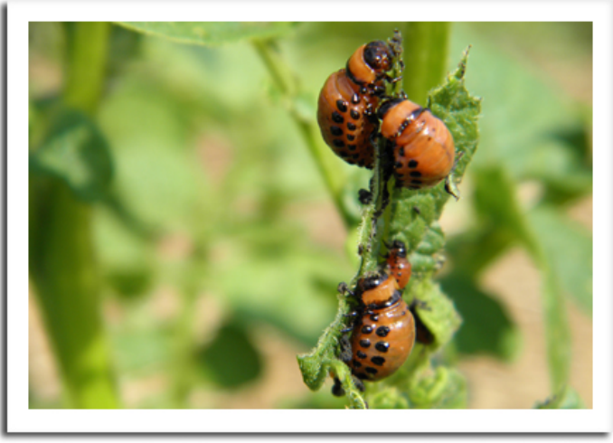
Colorado potato beetle larvae

colorado Potato BEETLE: Oviposition has started across southern and central Wisconsin. The bright orange-yellow eggs deposited by the females should now be apparent on the undersides of potato leaves. At normal June temperatures, the eggs hatch in 4-8 days and larvae mature to the third instar stage in another 5-9 days. These early individuals are usually less destructive than the summer generation. Treatment is justifiable for pre-flowering, 6- to 8-inch potato plants when defoliation exceeds 20-30%.