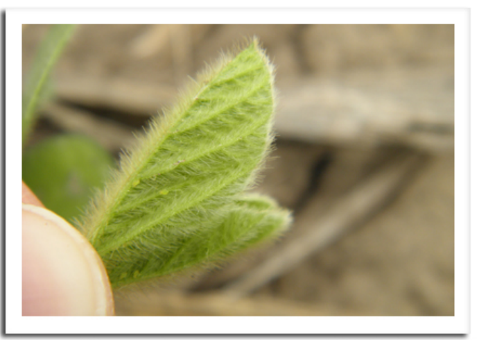
Soybean aphids on newest soybean growth

SOYBEAN APHID: Results of a two-year study published in the April 2017 issue of Pest Management Science support previous research demonstrating that neonicotinoid insecticide seed treatments for soybean aphid control provide no yield advantage. Data from field studies in 12 Midwestern states showed that the window of aphid suppression offered by seed treatment is relatively short (about three weeks or until V2), and that tissue concentrations of the neonicotinoid thiamethoxam in soybean foliage are too low to effectively control aphids by the time populations peak in late July and August. The study concludes that neonicotinoid seed treatments do not provide a consistent return on investment and that an IPM approach utilizing scouting and foliar-applied insecticide at the established 250 aphid-per-plant economic threshold remains the best option for soybean aphid management. Further, neonicotinoid seed treatments pose added risks to non-target organisms in terms of off-target movement (i.e., planter dust) and environmental persistence: http://ento.psu.edu/extension/field-crops/factsheet-Effectiveness-of-Neonicotinoid-Seed-Treatmentsin-Soybean