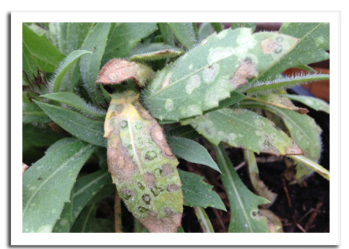
Gaillardia with white smut

WHITE SMUT: This fungal disease has been reported among plants for sale in southeastern Wisconsin over the past few weeks. Found most commonly on Gaillardia or blanket flower, white smut can be recognized by the faint whitish leaf spots that enlarge and turn brown in the center, with a white border or halo. Close spacing and overhead irrigation can increase the occurrence of white smut and should be avoided. Removal and disposal of diseased foliage and infected plants is also recommended. Plants in greenhouses may benefit from fungicide applications, whereas affected landscape plantings require complete removal at the end of the season to prevent future infection.