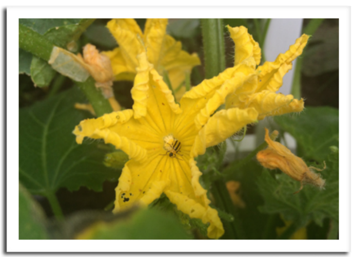
Striped cucumber beetle

introduce the bacterial disease into cucumbers, melons and squash through feces or contaminated mouthparts. The first symptom of bacterial wilt on cucumber and melon is a distinct flagging of lateral and individual leaves. Early beetle control may be justified for populations of one beetle per plant in melons, cucumbers and young pumpkins, and five beetles per plant for less susceptible cucurbits such as watermelon and squash.