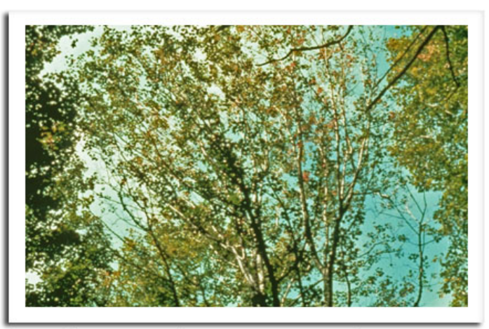
Sapstreak on sugar maple

Northeast region : Root rot on northern red oak, verticillium wilt on Deborah maple and root girdling on northwoods maple in Oneida County.