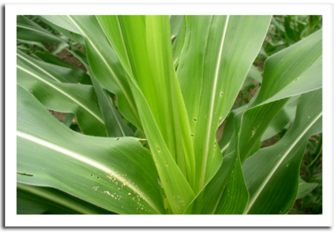
European corn borer feeding injury

days near Green Bay, Wausau and Medford. Pupation is expected to begin in areas where 1,272 GDD will be reached by July 1 or 2, such as Beloit, Dubuque, and La Crosse. The first summer moths should appear in black light traps in these locations by July 8 or 9, if evening temperatures are conducive for flight activity.