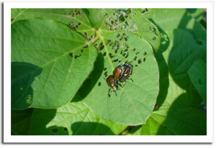
Japanese beetles on soybean leaves by Ron Hines, Univ of IL, The Bulletin

Japanese beetle - The distinctive skeletonization of leaves caused by this insect is evident in many southwest and south central soybean fields. Light to moderate defoliation, ranging from 5-25%, was observed on a maximum of 14% of the plants in Dane, lowa and Sauk counties. No more than 30% defoliation should be tolerated during the vegetative stages of growth, 20% defoliation for flowering soybeans, and 25% defoliation after pod fill.