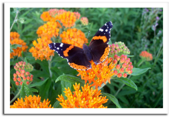
Red admiral, Vanessa atlanta

Contrary to its common name, the red admiral is mostly black in color, and may be distinguished from related butterflies in the genus Vanessa by the small, white spots and prominent red-orange band on each of the forewings, and a red-orange band along the margins of the dorsal hindwings. The red admiral is a seasonally migratory species. The butterflies now active are the progeny of migratory butterflies that arrived in May. Explosions such as this one are infrequent in Wisconsin, occurring approximately every eight to 10 years. This season's high population may be due to increased winter survival, decreased predation, parasitism and disease, and the widespread availability of the preferred food plant nettle. Adults are expected to be active for another week to 10 days.