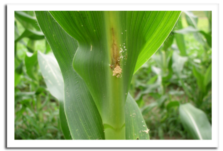
European corn borer frass and entrance hole

into the bases of corn stalks in advanced Dane and La Crosse County fields.