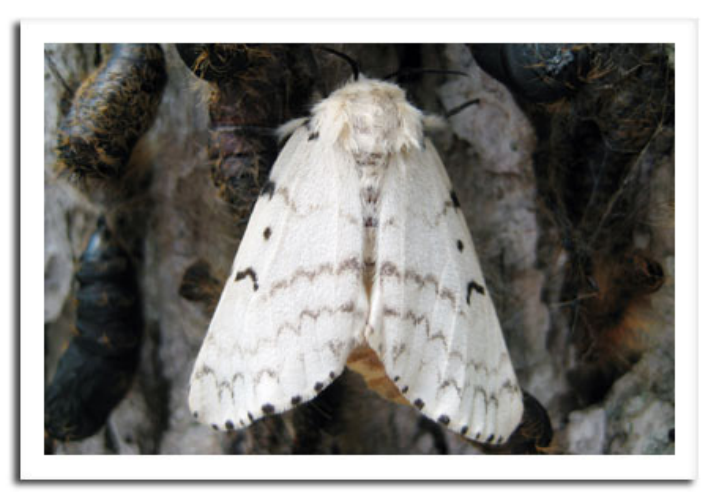
Female gypsy moth

At this time, gypsy moth caterpillars are beginning to pupate. About 10 days after pupating, moths will begin to emerge. Recently, there have been reports of flying male moths, according to Mark Guthmiller from the DNR. A female moth also was sighted at Rocky Arbor State Park earlier this week.