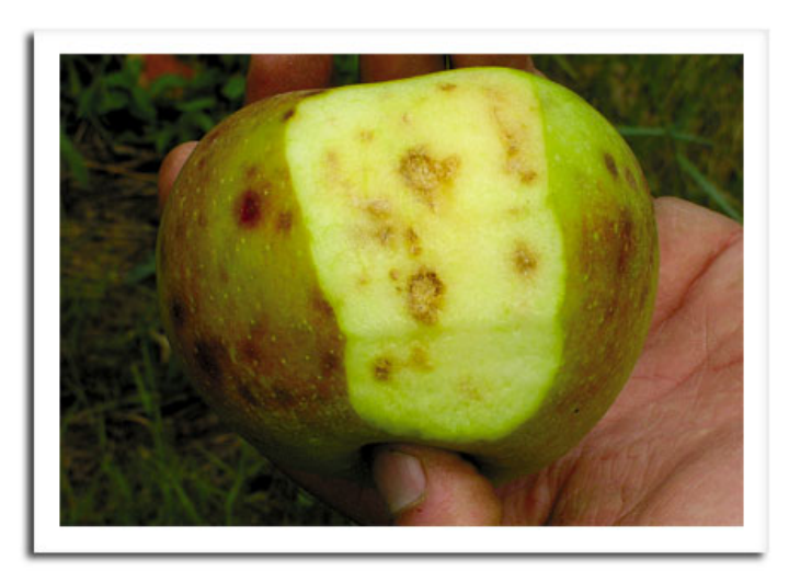
Brown marmorated stink bug damage

STINK BUG: Surveys in field crops suggest that activity is escalating and stink bugs are likely to start invading orchards in greater numbers. Growers can begin inspecting fruits in the week ahead for dimples or dark, irregular circular depressions typical of stink bug feeding, and should flag sites with multiple depressions on the same fruit or tree. Damage is often limited to specific areas in the orchard and depending on the distribution of the population, spot treatment may be adequate.