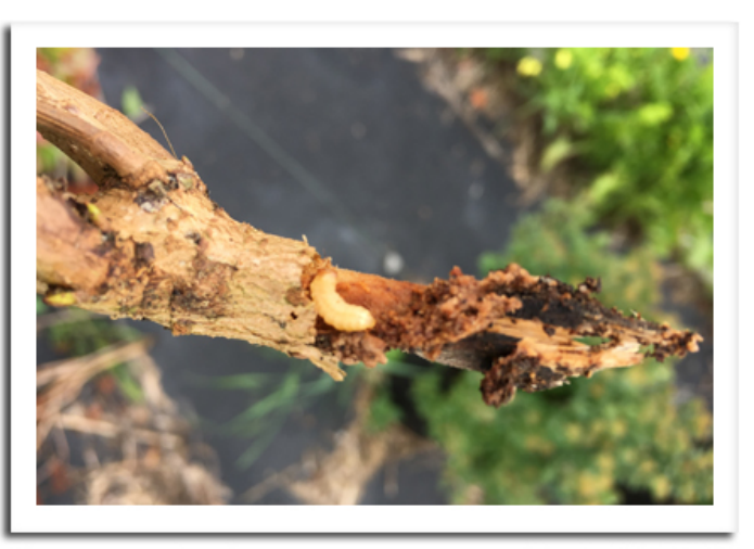
Viburnum crown borer larva

VIBURNUM CROWN BORER: Nursery inspectors determined that highbush cranberry shrubs in Oneida County showing branch flagging were infested with the viburnum crown borer. The larvae of this clearwing moth attack the base of viburnum shrubs, tunneling in the cambium just under the bark from below the soil line to about 18 inches high. Initial symptoms include wilting, sparse foliage and early fall color. Younger plants, those that have just been transplanted, and plants under stress appear to be more susceptible to infestation.