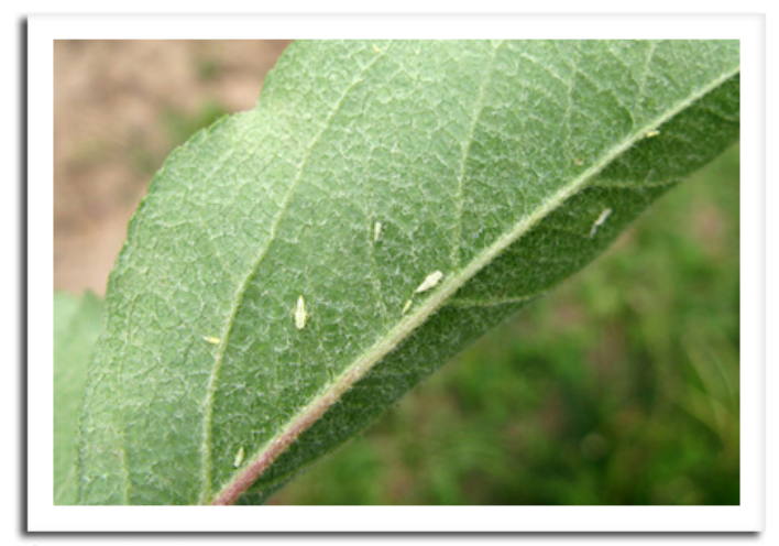
White apple leafhoppers

should target first-generation nymphs, but if justified, treatments for the second generation are also effective.