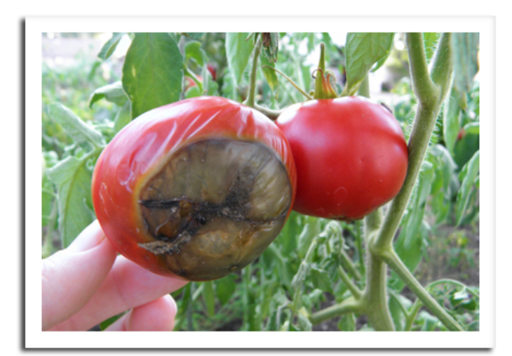
Blossom end rot on tomato

watering thoroughly once or twice each week to moisten the soil to a depth of six inches is advised.