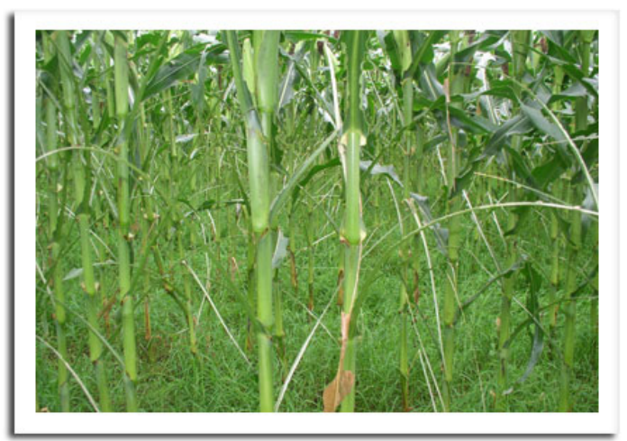
Corn plants defoliated by armyworms

larvae, and not the extent of the current damage. Sampling five sets of 20 plants (100 total) for armyworms and signs of feeding is required. Spot treatment is acceptable for infestations of two or more armyworms (3/4 to 1 inch or smaller) per plant on 25% of the plants, or one worm per plant on 75% of the plants. Treating small grains is suggested for levels of three or more armyworms per square foot, though much of the small grains acreage is reaching full maturity. Producers and advisors are reminded to cross check PHIs to make sure that the insecticide align with harvest plans.