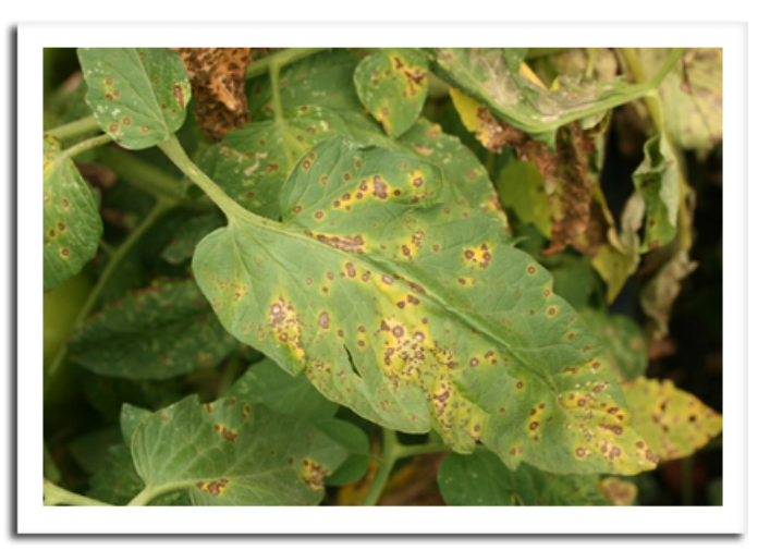
Septoria leaf spot on tomato

Cultural controls include a one-year rotation out of tomato, staking plants to promote air flow, applying mulch around the base of plants to minimize water splash, and eliminating sources of inoculum in the field by removing or destroying tomato debris by deep plowing immediately after harvest.