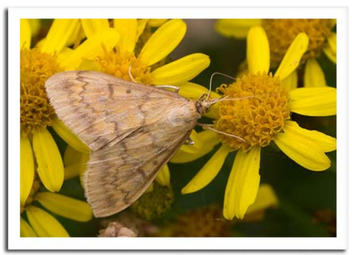
European corn borer moth

before 2,100 degree days (modified base 50°F) are surpassed and the treatment window for second generation corn borers closes.