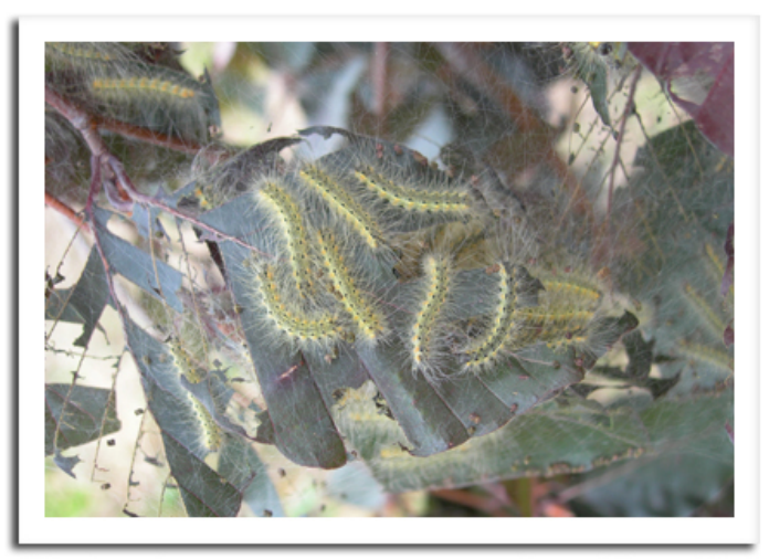
Fall webworm larvae

FALL WEBWORM: The characteristic nests constructed by fall webworm larvae are appearing in southern and central Wisconsin. This native species feeds on over 120 different species of deciduous forest, shade, fruit, and ornamental trees, but avoids conifers. Its nests or webs appear in trees later in the season than nests made by other web- and tent-making species found in Wisconsin.