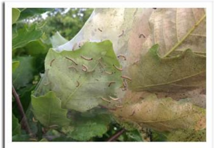
Fall webworm larvae and nest

FALL WEBWORM: Nests or webs made by fall webworm larvae were noted this week on oak trees in a Jefferson County nursery. These characteristic webs appear later in the season than those of other web or tent making larvae in Wisconsin (e.g., eastern tent caterpillar and forest tent caterpillar). The larvae and their tents are primarily an aesthetic problem that can be easily controlled by manual removal or pruning.