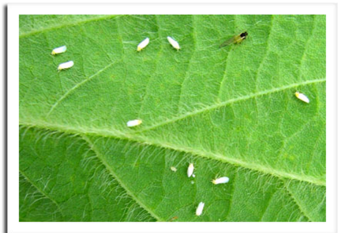
Whiteflies on underside of soybean leaf

WHITEFLY: Minor infestations were observed this week in soybeans in the west-central and southwest counties. Whiteflies are a common pest of greenhouse plants and commercial vegetables with high reproductive potential and known resistance to several insecticides. Their sporadic appearance in Wisconsin soybeans is primarily a curiosity since yield reductions have never been documented.