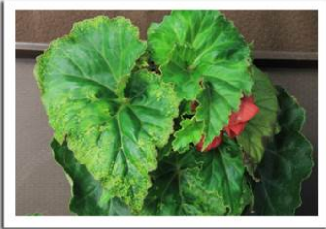
Impatiens necrotic spot virus on begonia

Greenhouses and retailers cooperated with inspectors by removing all virus-infected plant materials from sale.