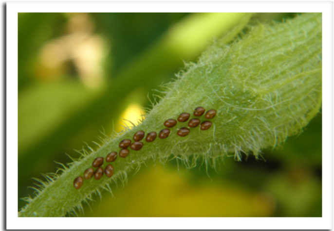
Squash bug eggs

them in a bucket of soapy water. Gardeners are also advised to dispose of dead leaves and other plant material which can harbor large numbers of nymphs.