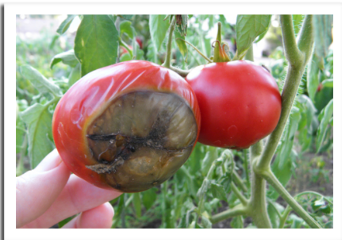
Blossom end rot on tomato

BLOSSOM END ROT: This disorder of tomatoes, peppers, watermelons and squash is appearing in commercial and home gardens, according to grower reports. The dark, water-soaked spot that starts at the blossom end of the fruit and enlarges around the fruit surface is caused by calcium deficiency or inconsistent soil moisture levels. Since this disease is physiological in nature, fungicides and insecticides are useless as control measures. Maintaining even soil moisture levels throughout the season will usually limit its development.