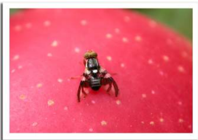
Apple maggot fly

APPLE MAGGOT: Counts have been variable since fly emergence began four weeks ago, with some of the highest numbers occurring in orchards with fruits damaged during earlier hailstorms. According to John Aue of Threshold IPM Services, the volatiles produced by ripening, hail-damaged apples are highly attractive to AM and other fruit flies, and the number of AM flies captured on traps represents only a fraction of the fruit flies potentially entering the orchard. He notes that other flies in the genera Rhagoletis and Drosophila can inflict similar damage to hail-injured fruit.