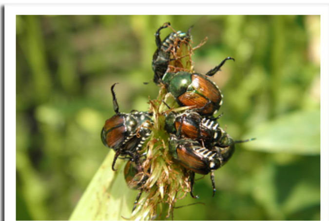
Japanese beetles feeding on corn silks

JAPANESE BEETLE: Minor infestations of 1-14 beetles per 100 plants have been observed since early July in scattered fields in the southern and west-central counties. The greatest threat to corn at this time of year is when large numbers of beetles converge on corn silks, potentially impairing pollination. Control is warranted for populations that exceed three beetles per ear when pollination is occurring.