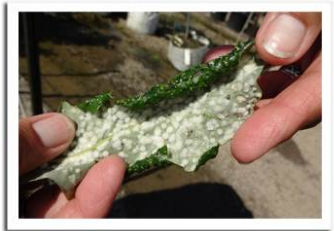
Flake galls on oak

OAK GALLS: Nursery inspections in the past week found an assortment of galls on oak, including oak cynipid galls, oak flake galls and noxious oak galls. Galls are abnormal outgrowths of plant tissue caused by insects, fungi, bacteria, nematodes or mites. These growths may develop on any plant part, but most commonly occur on the branches and leaves. Chemical treatment should be timed to control the adult stage, if justified. Pruning and destroying infested plant parts are the preferred control methods.