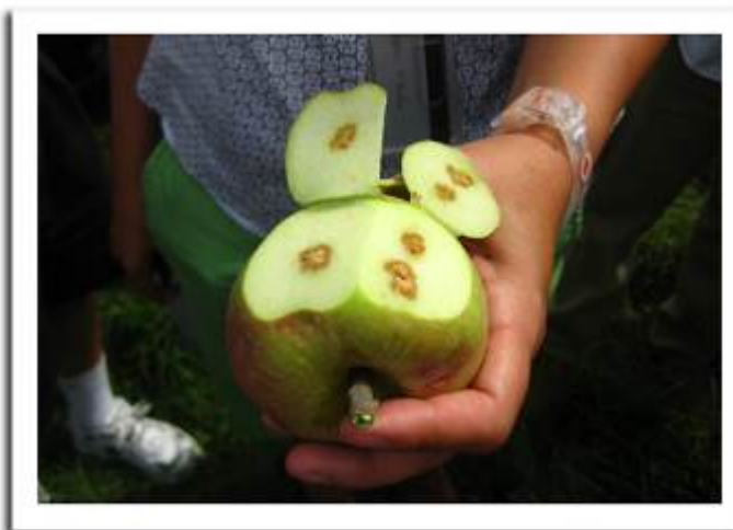
Stink bug damage to apples

STINK BUG: Apple growers who experienced stink bug damage last season should begin inspecting fruits for dimples or dark, irregular circular depressions typical of stink bug feeding, and flag sites with multiple depressions on the same fruit or tree. This pest commonly migrates into orchards from field crops and wild hosts at this time of year. Damage is usually limited to specific areas in the orchard and depending on the distribution of the population, spot treatment may be adequate.