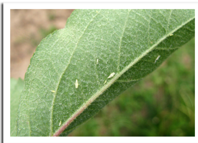
White apple leafhoppers

should target first generation nymphs, but if justified, treatments for the second generation are also effective.