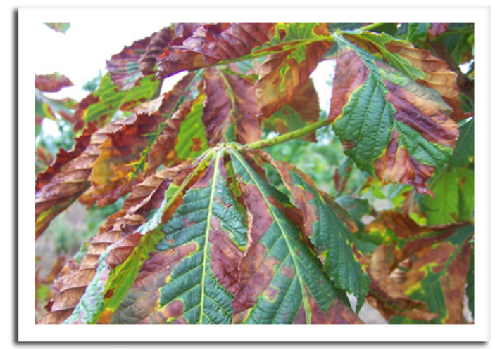
Guignardia leaf blotch on horse chestnut

that distort affected foliage as they increase in size and severity. Disposing of fallen leaves in autumn and pruning the canopy are recommended to reduce inoculum levels.