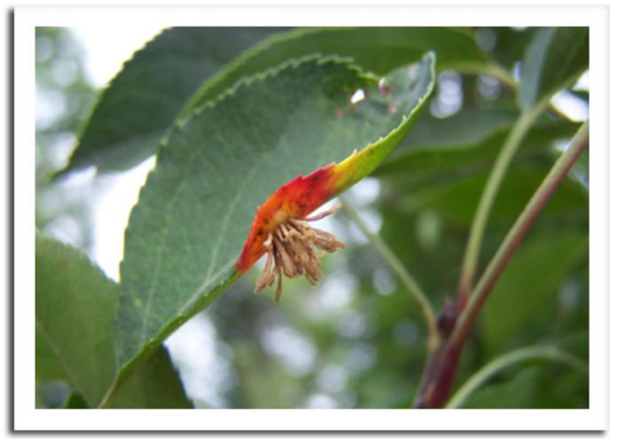
Cedar-hawthorn rust aecia on leaf underside

CEDAR-HAWTHORN RUST: Humid, wet growing season weather has promoted development of this rust disease, which requires a rosaceous host and a juniper host. The characteristic pinkish aecia (tubes) are evident on the leaves of hawthorns in Dodge, Pierce and St. Croix counties. Selecting resistant hawthorn cultivars and thorough sanitation by removing infected twigs, fruit and leaves are the recommended controls. Fungicide treatments applied to new growth in spring may be needed in extreme cases.