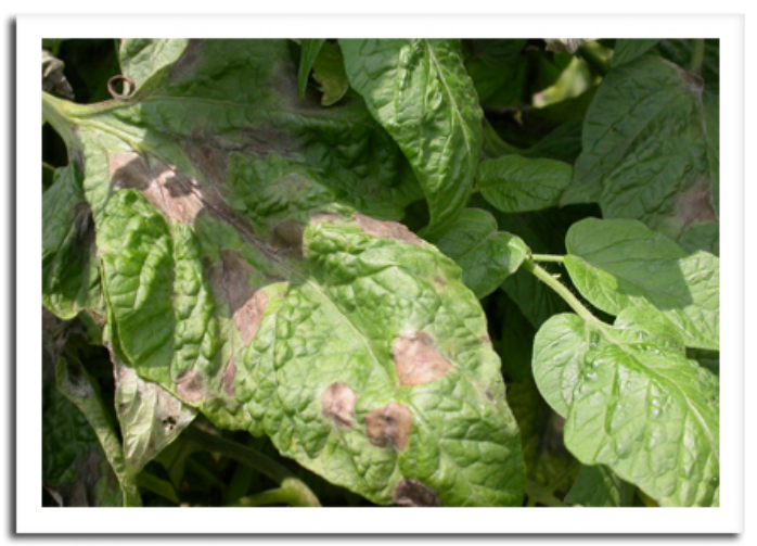
Late blight on tomato

LATE BLIGHT: Cases of late blight have been confirmed by the UW in Dane and Polk counties since August 15. Protective fungicide treatments should be maintained to prevent this disease from developing in tomato and potato crops as harvest continues. Home gardeners, direct marketers and commercial producers who suspect late blight are encouraged to send symptomatic plant material to the UW Plant Disease Diagnostic Clinic for free testing: <u>https://pddc.wisc.edu/sample-collectionand-submission/</u>.