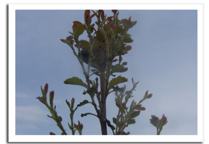
River birch with "mouse-ear" leaf disorder

MOUSE-EAR OF BIRCH: River birch trees grown at a nursery in Dodge County were showing signs of this growth disorder of potted nursery trees. The stunted or "mouse-eared" leaves are thought to be caused by nickel deficiency. A foliar application of nickel sulfate in mid-October or soon after budbreak can correct this condition. Lowering soil media pH to 5.0-6.0 is also recommended.