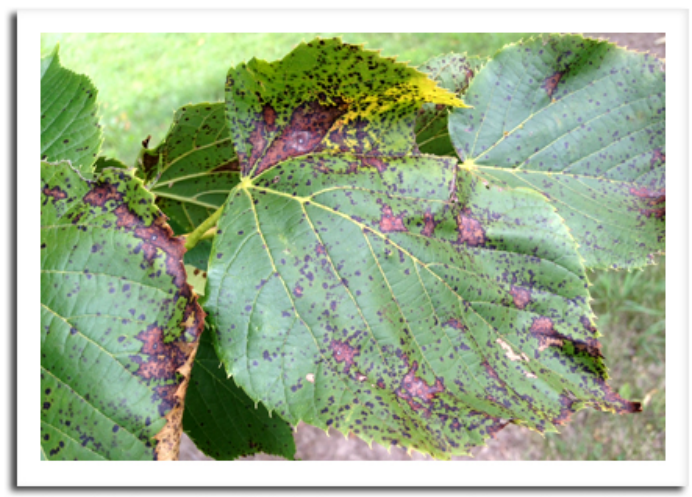
Redmond linden with leaf blotch fungus Konnie Jerabek DATCP

Although the leaf damage can be pronounced, most leaf spot diseases do not seriously harm trees. Raking and destroying fallen leaves before the first snowfall, taking measures to avoid overcrowding plants, and pruning trees to increase light penetration and airflow are all strategies that can collectively reduce leaf spot diseases on trees in following years.