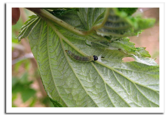
Obliquebanded leafroller larva

OBLIQUEBANDED LEAFROLLER: Orchardists are reminded to maintain pheromone traps for this insect throughout September. Second-generation larvae occasionally cause severe fruit damage late in the growing season and moth counts in late August and September can be a predictor of damage potential by first brood larvae next spring.