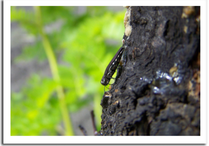
Honeylocust borer adult

with any trunk boring insect must be removed from sale and destroyed.