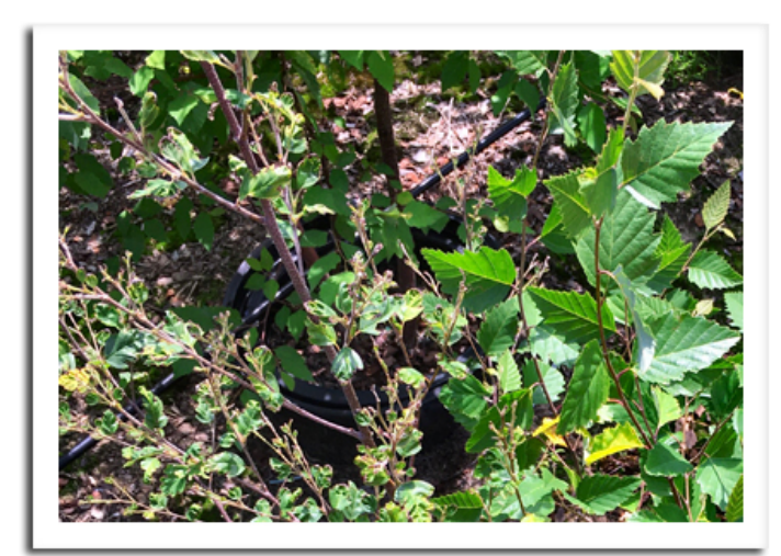
Mouse ear disorder on river birch

Symptoms include stunted, wrinkled and cupped foliage, with leaves often being abnormally dark green with necrotic margins. New growth commonly has shortened internodes that give affected trees a "witches-broom" or spikey appearance.