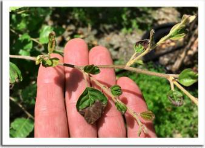
Mouse ear disorder on river birch

MOUSE-EAR DISORDER: The river birch disorder known as "mouse-ear" disorder, "little leaf," or "squirrel ear" was observed by inspectors in a central Wisconsin nursery. According to the grower, mouse-ear has been a periodic problem in the nursery since the 1970s, particularly in container-grown river birch trees.