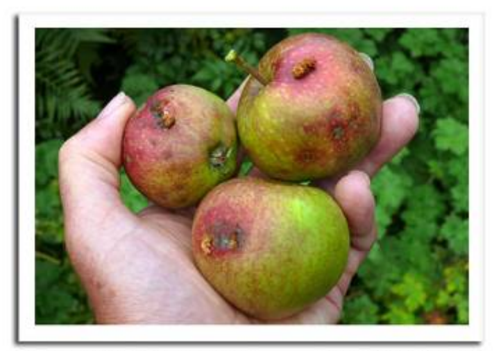
Codling moth larval damage to apples

bers have begun to decline at most sites. Apple growers are reminded that evaluating second-generation larval damage by early September will help to anticipate first-generation codling moth pressure next season. Orchards that have recorded captures higher than 10 moths per trap per week since the second flight began in July should find visible fruit damage at harvest. If trap counts were high (>10 per week) yet no damage is observed this fall or less than 1% of fruits are infested, then the source of the moths is likely from outside of the orchard.