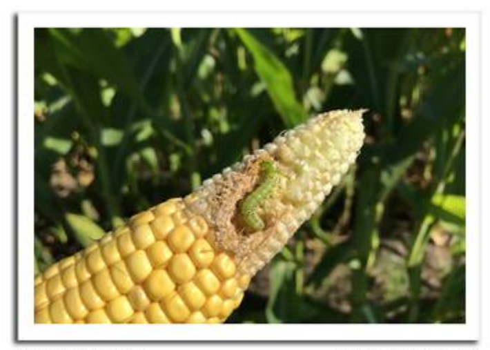
Corn earworm larva

CORN EARWORM: Late-season moth migrations escalated this week. The DATCP pheromone trapping network captured 645 moths in 18 traps between August 20 and 26, for a cumulative total of 1,650 moths since mid-July. The high count for the reporting period was 184 moths at Arlington in Columbia County. The latest activity signals that fresh market and processing sweet corn remains at risk of infestation and should be monitored until harvest. Counts for the week ending August 26 were: Arlington 40, Arlington North 184, Beaver Dam 153, Bristol 27, Coon Valley 6, Cottage Grove 3, Hancock 3, Madison airport 11, Mayville 115, Ripon 81, Sun Prairie 15, Sun Prairie North 6, and Wausau 1.