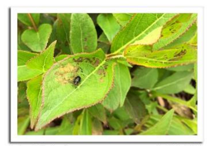
Redheaded flea beetle

REDHEADED FLEA BEETLE: Damage caused by redheaded flea beetles has been notably high in nurseries throughout the state this season. Once considered mainly a pest of agricultural crops, this generalist defoliator has become an increasingly serious pest on a wide assortment of nursey stock. Favored plants include dogwood, hydrangea, Itea, weigela, and various fruits and berries. Nursery managers have expressed concern about the beetles migrating from nearby crops into nursery production areas, where the threshold for damage is much lower.