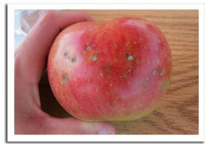
Apple maggot damage

APPLE MAGGOT: Flies are expected to persist in orchards for several more weeks, or until about 2,800 degree days (modified base 50°F) have been reached. The modified base 50°F accumulation as of August 26 was 2,404 at Beloit, 2,364 at Madison and 2,191 at Racine. Apple maggot pressure has been variable but generally low this season. Continued maintenance of red sphere traps is recommended through early September.