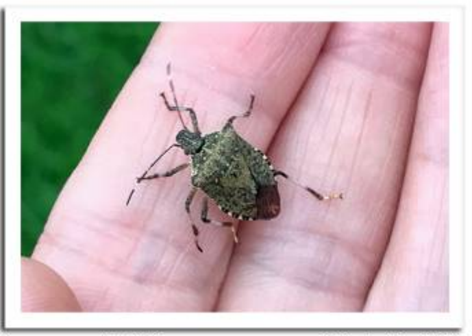
Brown marmorated stink bug

BROWN MARMORATED STINK BUG: Fruit growers are advised to watch for swarms of this pest on warm fall days as the bugs aggregate in search of overwintering sites. Brown marmorated stink bug is now well established throughout much of southern and eastern Wisconsin, with the highest densities concentrated in the areas from Fond du Lac north to Green Bay and in southern Wisconsin from Dane and Rock counties east to Milwaukee. Nymphs and adults usually remain active through October or early November.