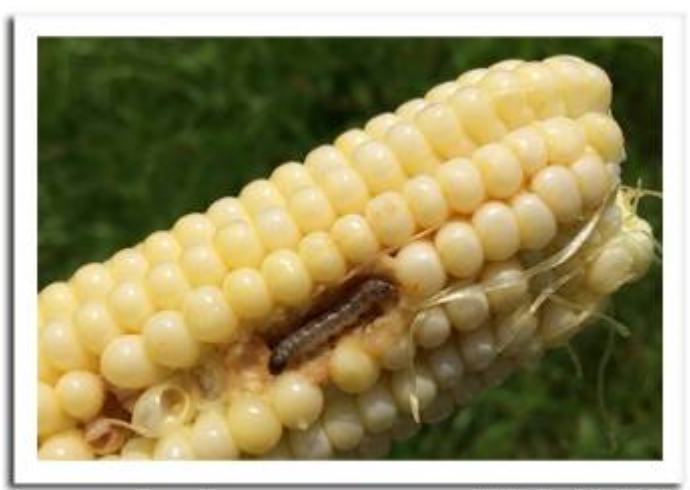
European corn borer larva

EUROPEAN CORN BORER: The second flight of moths continued at very low levels (≤ 11 moths) at a few black light trap locations. Meanwhile, surveys in corn found light infestations and larvae ranging from third- to fifthinstar in Brown, Clark, Door and Oconto counties. The European corn borer treatment window has closed for the season across the southern and central counties.