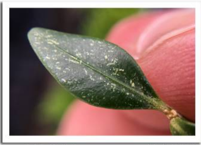
Boxwood spider mite stippling

SPIDER MITES: Nursery inspections continue to find heavy spider mite pressure on a variety of plants, including daylily, rose, and many other ornamentals and trees.