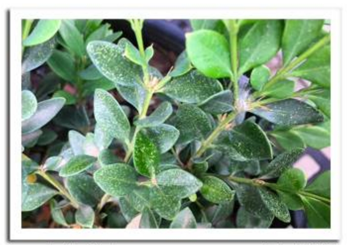
Boxwood spider mite damage

Light infestations can be resolved with insecticidal oil or a soap spray applied two times, 7-10 days apart. Heavy infestations may require a residual miticide. Natural enemies (ladybugs, minute pirate bugs, predatory thrips or predatory mites) are also very important for regulating mite outbreaks. Since spider mites thrive in dry, dusty conditions, rinsing tree branches and keeping bare patches of ground damp to reduce flying dust can help with control on tree farms and in orchards.