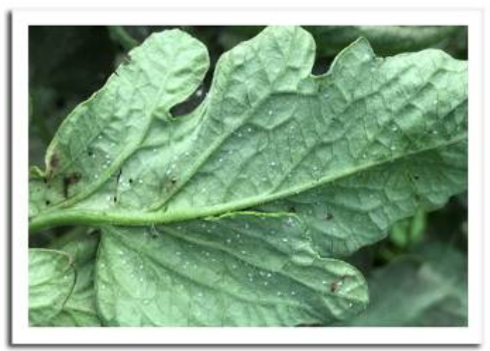
Whiteflies on tomato leaf

ing the commercially available parasitic wasp Encarsia formosa , is an option for growers who experience consistent whitefly problems.