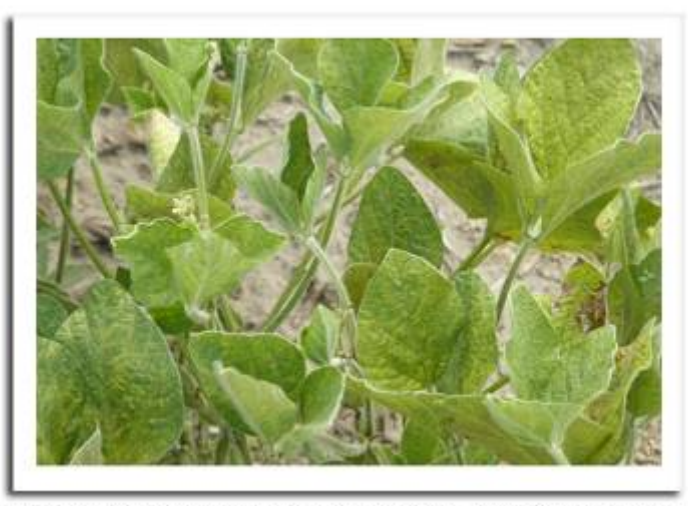
Soybeans with yellowing and stippling due to mites Krista Hamilton DATCP

TWO-SPOTTED SPIDER MITE: Leaf stippling and bronzing symptoms have intensified in some western Wisconsin fields with this month's dry weather pattern. Scouting for mites is suggested for one more week. Treatment of this pest is only beneficial prior to the R5 to R5.5 or full pod growth stages.