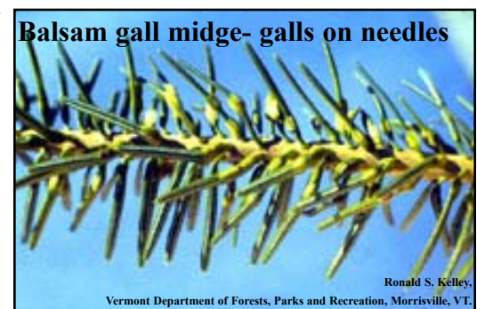
Balsam gall midge- galls on needles

Female midges lay their eggs between the needles of partially opened buds. This