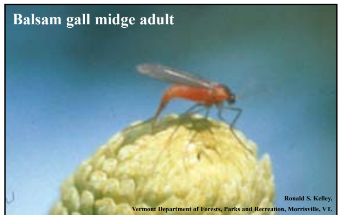
Balsam gall midge adult

Balsam gall midge- This small insect has been having a banner year in Wisconsin Christmas tree fields. Reports throughout the northern half of the state indicate moderate to heavy amounts of injury on balsam and Fraser fir.