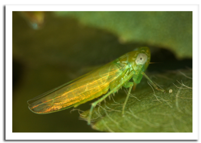
Potato leafhopper adult

POTATO LEAFHOPPER: Levels of this insect have increaseed abruptly in the last two weeks. Non-bearing, one- to two-year-old apple trees are most susceptible to feeding by leafhopper adults and nymphs and should be inspected for upwards leaf cupping and yellowing of terminal shoots. Treatment is justified at levels of one or more nymphs per leaf when symptoms are developing.