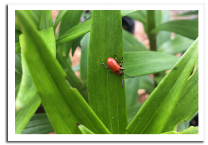
Lily leaf beetle

Taylor County on June 26. First reported in Marathon County in 2014, LLB has now been confirmed in eight Wisconsin counties. The adult beetles are bright red and conspicuous, while the larvae can be found by inspecting Asiatic lily leaves for defoliation. The leaf damage caused by LLB larvae can be significant and, without intervention, will eventually kill the plant. Recommended controls include manually removing and killing adults and larvae, scraping eggs from the undersides of leave, or applying an insecticide labeled for use on ornamental plants.