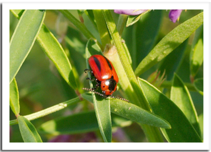
Red turnip beetle

sum and yellow rocket are thought to be the primary food plants. Small seedlings and transplants are the most susceptible to red turnip beetle feeding, while established plants can tolerate severe defoliation. Removing the adult beetles by hand is the recommended control. Beetle numbers usually decline by early to mid-July.