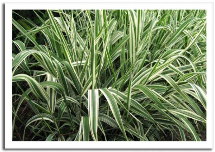
Invasive ribbon grass

Control of ribbon grass is labor-intensive and costly, often requiring sequential years of mechanical and chemical intervention (mowing, hand pulling, soil tilling, herbicide application, etc.) and burning.