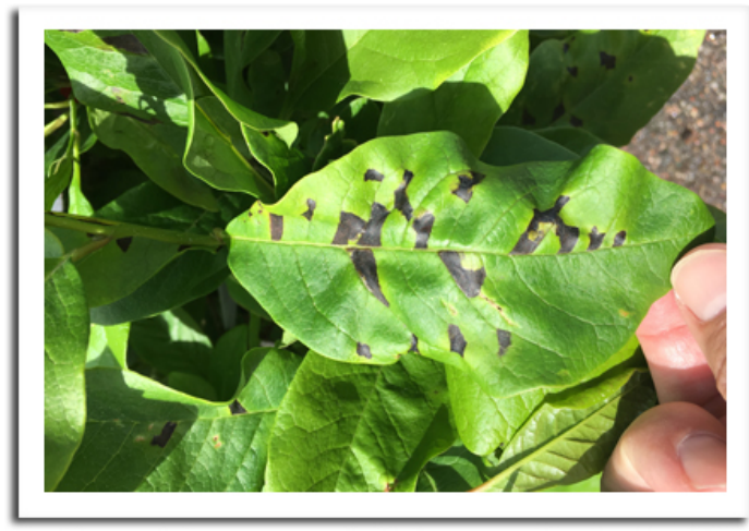
Pseudomonas leaf spot on magnolia 'Ann'

PSEUDOMONAS BACTERIAL BLIGHT: Nursery inspectors found symptoms of this bacterial disease on 'Ann' magnolia in Iron and Marathon counties. Bacterial leaf blight was previously noted on several varieties of common lilac shrubs in late May, in southern Wisconsin nurseries. Although the causal pathogen Pseudomonas syringae is named for lilac, from which it was first Isolated, it has a wide host range. On magnolia, symptoms of infection appear as angular, dark brown leaf spots that may have a yellowish halo. Problems can be exacerbateed by overhead watering and are usually more common in seasons with prevailing cool, wet weather.