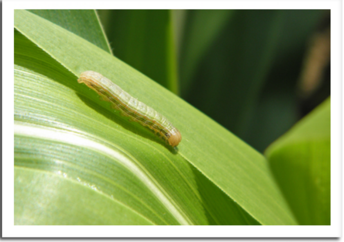
True armyworm larva

creased monitoring for first-generation armyworm larvae is particularly important at this time.