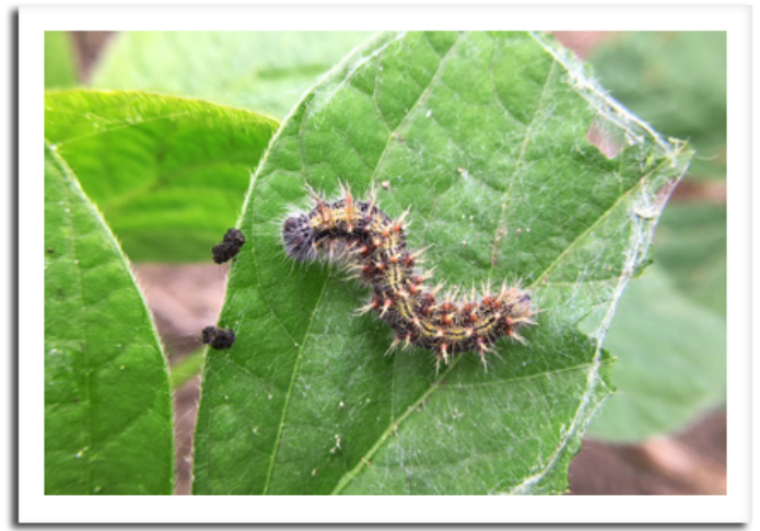
Thistle caterpillar on soybean leaf

SOYBEAN DEFOLIATORS: A variety of minor defoliators can be found at very low levels in many soybean fields. Included in this category are bean leaf beetles, green fruitworm larvae, grasshopper nymphs, obliquebanded leafrollers, rose chafers, silver-spotted skipper larvae, and thistle caterpillars, all of which were noted on fewer than 2% of plants examined in fields surveyed during the reporting period ending June 27. Prebloom soybean fields with combined defoliation rates of 30% or more may qualify for treatment, though defoliation in the vegetative stages seldom results in yield loss, especially when soil moisture, temperatures and other growing conditions are favorable. The economic threshold is lowered to 20% defoliation once soybeans reach the bloom and postbloom stages.