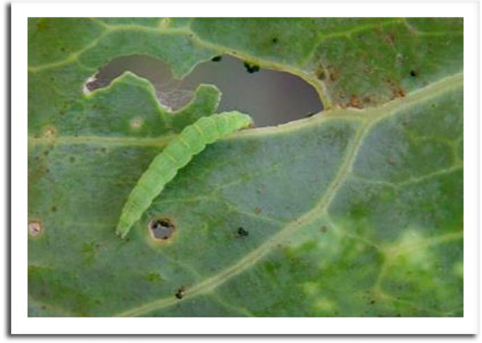
Diamondback moth larva

CABBAGE CATERPILLARS: Low to moderate infestations of diamondback moths and imported cabbageworms were recently observed in southern and western Wisconsin community gardens. The larvae of these cabbage pests feed on leaves and cause large ragged holes, eventually infesting the developing heads of broccoli, cabbage and cauliflower.