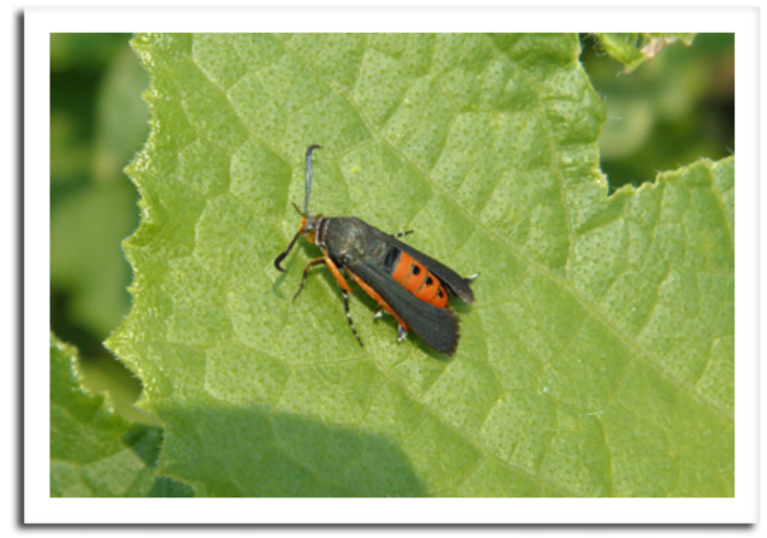
Squash vine borer moth

vent the larvae from boring into the vines. Gardeners may remove the eggs by scraping them off with a fingernail. Covering plants with row covers or netting to prevent egg deposition and placing yellow pheromone-baited sticky traps around plantings may also help to reduce problems. A conventional insecticide or kaolin clay applied to the plant bases as a weekly spray during the three- or fourweek egg laying period can provide protection if the sprays thoroughly cover the plant stems and are applied repeatedly to assure good control.