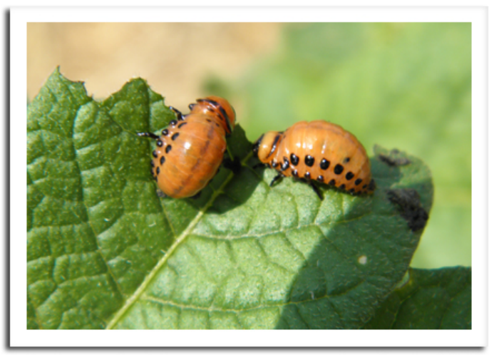
Colorado potato beetle larvae

COLORADO POTATO BEETLE: Larvae from overwintered beetles are predominantly in the early instars in southern and central Wisconsin. Controls should begin at this time, now that egg masses have hatched and while the majority of larvae are still small. Most first-generation CPB larvicide products must be reapplied 2-3 times at 7 to 10day intervals to control populations.