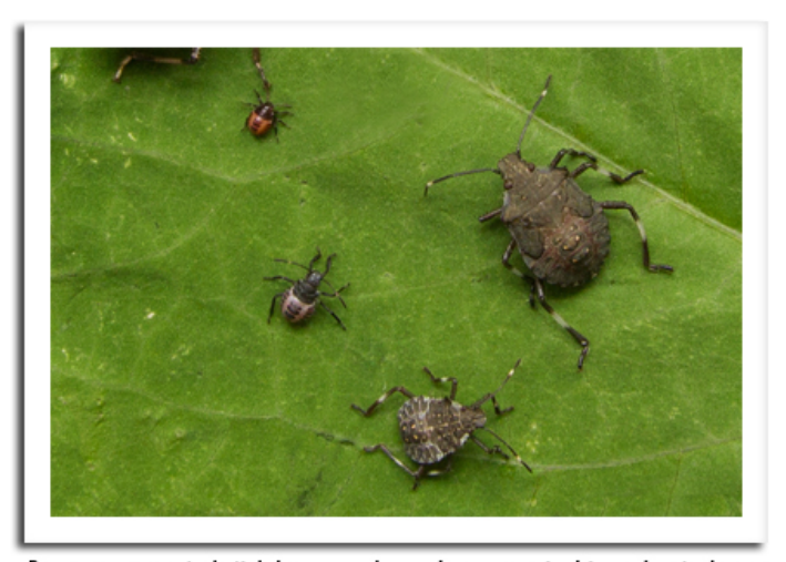
Brown marmorated stink bug nymphs

BROWN MARMORATED STINK BUG: Fruit growers and homeowners are advised to watch for swarms of this pest on warm fall days as the bugs aggregate in search of overwintering sites. BMSB is now well established throughout much of southern and eastern Wisconsin, with the highest densities concentrated in the areas from Fond du Lac north to Green Bay and in southern Wisconsin from Dane and Rock counties east to Milwaukee. Nymphs and adults usually remain active through October or early November.