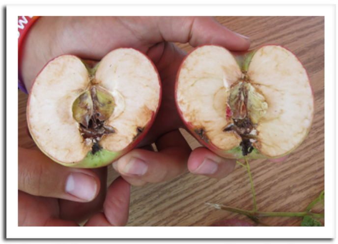
Codling moth damage

numbers have declined at most sites. Apple growers are reminded that evaluating second-generation larval damage by early September will help to anticipate first-generation codling moth pressure next season. Orchards that have recorded captures higher than 10 moths per trap per week since the second flight began in July should find visible fruit damage at harvest. If trap counts were high (>10 per week) yet no damage is observed this fall or less than 1% of fruits are infested, then the source of the moths is likely from outside of the orchard.