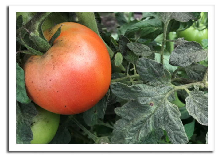
Sooty mold on tomato foliage and fruit

WHITEFLIES: A severe infestation of whiteflies was observed this week on tomato plants in a La Crosse County high tunnel. The flies were abundant enough that the tomato foliage and fruits had become covered in sooty mold from their honeydew secretions. Whitefly populations on this order can produce a noticeable yield reduction by impairing photosynthesis and contaminating the fruits. Eliminating all plants and weeds for at least one week prior to starting a new crop is critical step in reducing fly pressure. Whiteflies can also be managed through biological control, including the commercially available parasitic wasp Encarsia formosa .