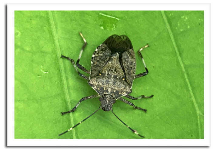
Brown marmorated stink bug

south-central, and portions of east-central Wisconsin are now high enough that BMSB has become an urban nuisance, and swarming can be expected this fall.