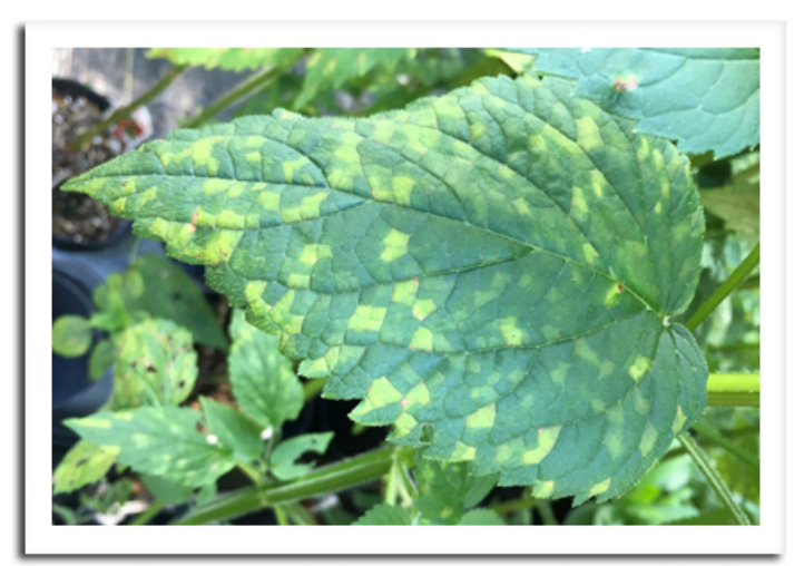
Downy mildew on giant purple hyssop

DOWNY MILDEW: The early stages of downy mildew infection were identified last week on giant purple hyssop plants in Vilas County. Initial symptoms appear as small greenish yellow, translucent spots that eventually spread to cover the leaf, fruit and/or flower. Affected areas may turn brown and later develop a downy gray fuzz. Fungicides are available downy mildew control.