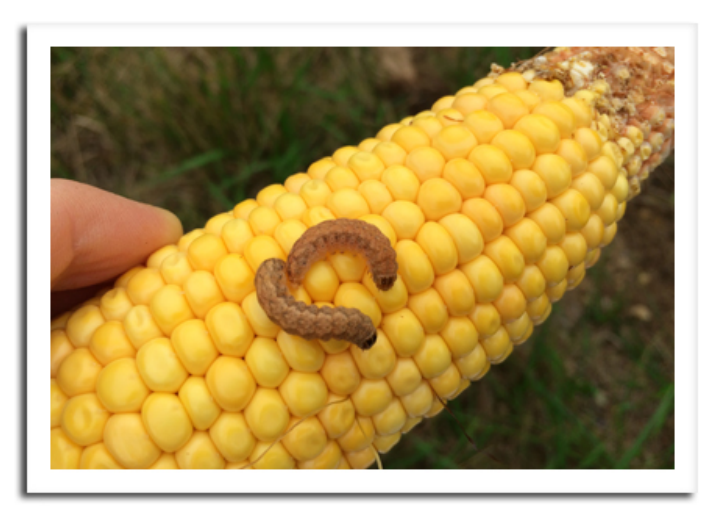
Western bean cutworm larvae

WESTERN BEAN CUTWORM: Larval infestations have been noted in Columbia, Green Lake, Marquette, and Winnebago counties in the last two weeks. In all instances, the o.75 to 1.5-inch caterpillars were located in the ear tips where control is ineffective. Most larvae were in the late instars and should enter the pre-pupal overwintering stage by early September.