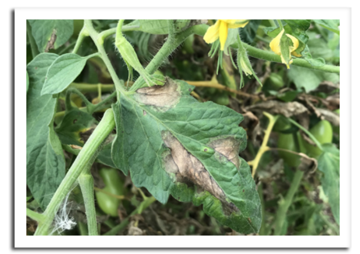
Late blight lesions on tomato

tion of all infected plants and debris is required if lesions are noticed. Composting will not generate sufficient heat to kill the pathogen and is not recommended.